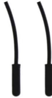
TES-22-w1.5 Dual Waterproof, Plastic, 1.5m Length