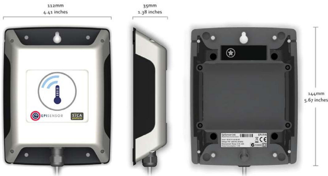
Dimensions for TES-21 / TES-22 Wireless Probe Temperature Sensor