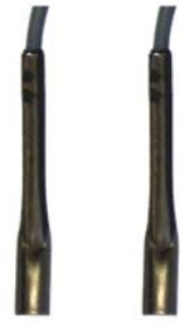
TES-22-p2.0 Dual Stainless Steel, Pipe Probe, 2.0m Length